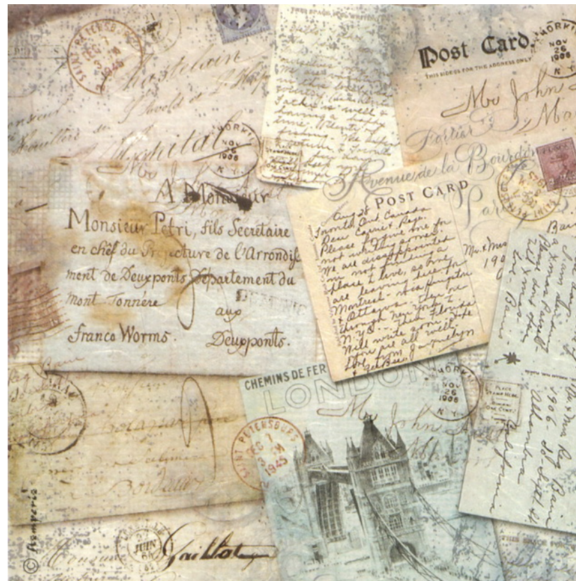
(Rice Paper - Old Post Cards, 2020)

Paper is now innovative and creative with the chemical makeup for the different types of paper substrates, suiting various needs. The paper industry is also a lot more environmentally conscious as well ( About Pulp & Paper , 2020). The industrialization of paper was only pushed in the last couple of centuries but have developed greatly in terms of production and economic consciousness. The development of paper when spreading across the world aided in the creation of multiple paper substrate to suit various uses of paper.