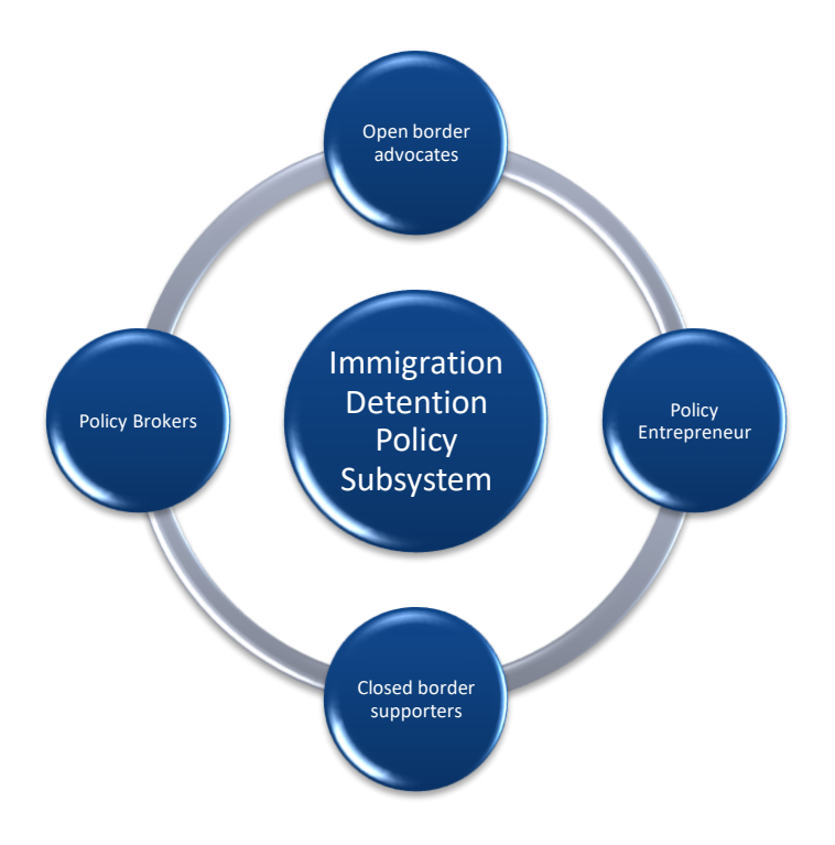
Figure 2: Actors in the Immigration Detention Policy Subsystem

Other actors in Canada's immigration detention subsystem include policy brokers who are "actors within sub-systems that seek to minimize conflict and produce workable compromises between competing advocacy coalitions" (Cairney 2011, p. 201). They provide solutions and aim to resolve conflicts between adversarial coalition groups (Sabatier & Weible, 2014). Bratt (2013) observes the meditative nature of policy brokers who consist of senior bureaucrats, elected officials and regulatory bodies. Within Canada's immigration detention policy subsystem policy brokers include the Federal Court of Canada and Supreme Court of Canada. The Minister of Public Safety and Emergency Preparedness is the Sovereign and the final decision-making governmental authority on policy issues relating to immigration detention. These actors in Canada's immigration detention subsystem play a role in promoting or challenging policies and policy changes surrounding the detention asylum seekers and irregular migrants for immigration purposes in Canada.