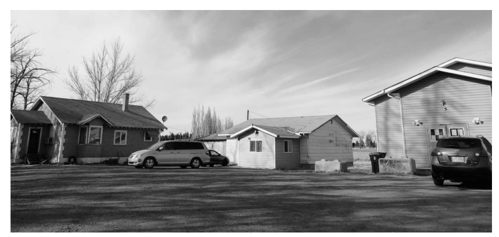
FIGURE 3: The Mosque (the building in the middle and on the right) in Brooks, Alberta was expanded in 2013 which provides a place of worship for the local Muslim population.