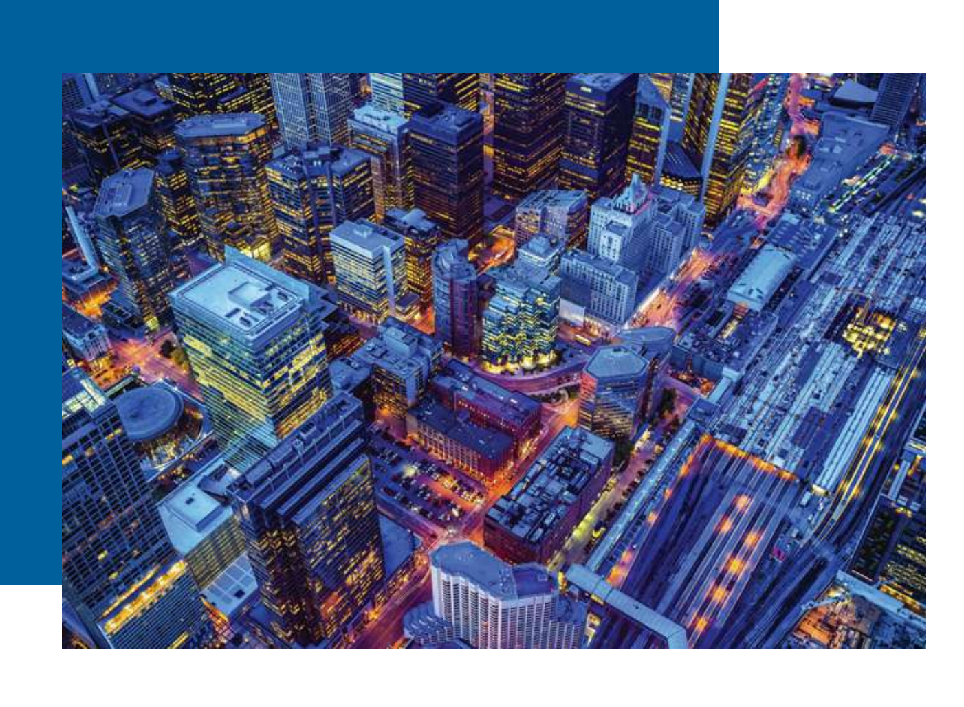
July 1, 2020