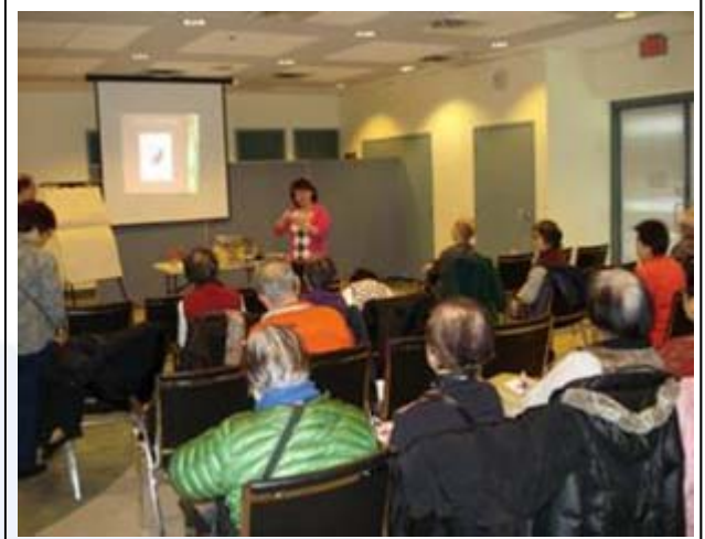
Skills-training and education workshop at the resource centre.

our reputation. Our quarterly courses and service overview is distributed via our website, via email, in addition to distributing to various medical centres, health clinics, pharmacies, local restaurants, and community centres. Our programs are advertised in the Chinese newspapers, radio stations and television community news as well. Caregivers who do not have time to attend workshops can visit our Resource Centre to pick up printed materials regarding services, diseases and caregiving tips for reference. Furthermore, the "Busting the Myths about Dementia" DVD is available for pick up at all Yee Hong locations. Our challenge is to locate those who need our services but are so busy trying to juggle work and other family commitments.