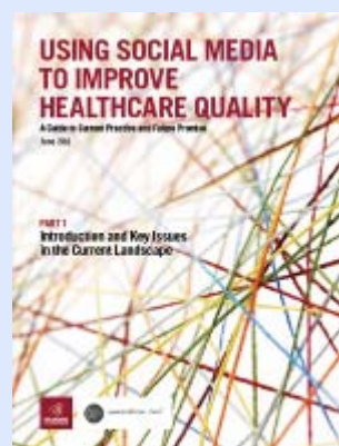
The Change Foundation Using Social Media to Improve Healthcare Quality