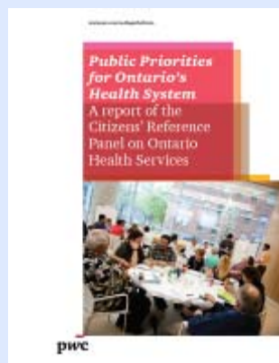
PricewaterhouseCoopers Public Priorities for Ontario's Health System