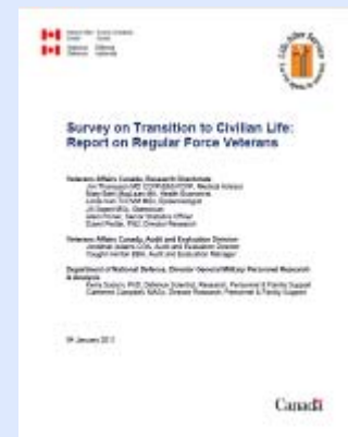
Veterans Affairs Canada/ Department of National Defense Survey on Transition to Civilian Life: Report on Regular Force Veterans