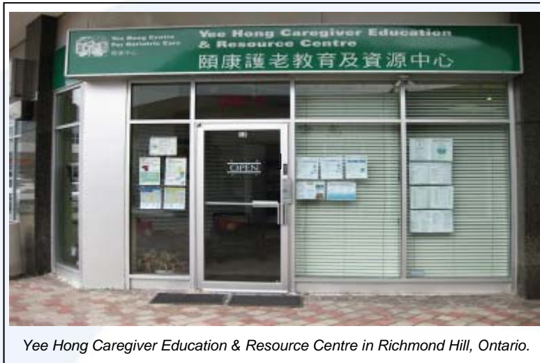
Yee Hong Caregiver Education & Resource Centre in Richmond Hill, Ontario.

The Yee Hong Caregiver Education & Resource Centre was established in 2008 with Aging at Home funding from the Central and Central East LHIN. The objective is to provide support, education and skills training for those caring for older people in the community.