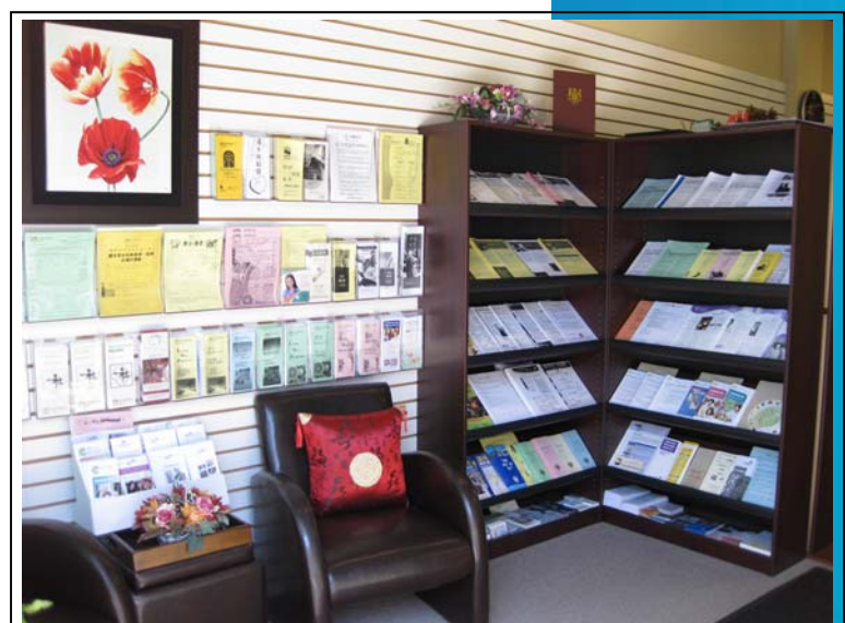
Brochures and other materials available at the resource centre.

Many Chinese caregivers do not look in the Yellow Pages or do online searches for programs. Instead, they rely on word-of-mouth recommendations from family, friends, doctors and other health providers. That's how we built