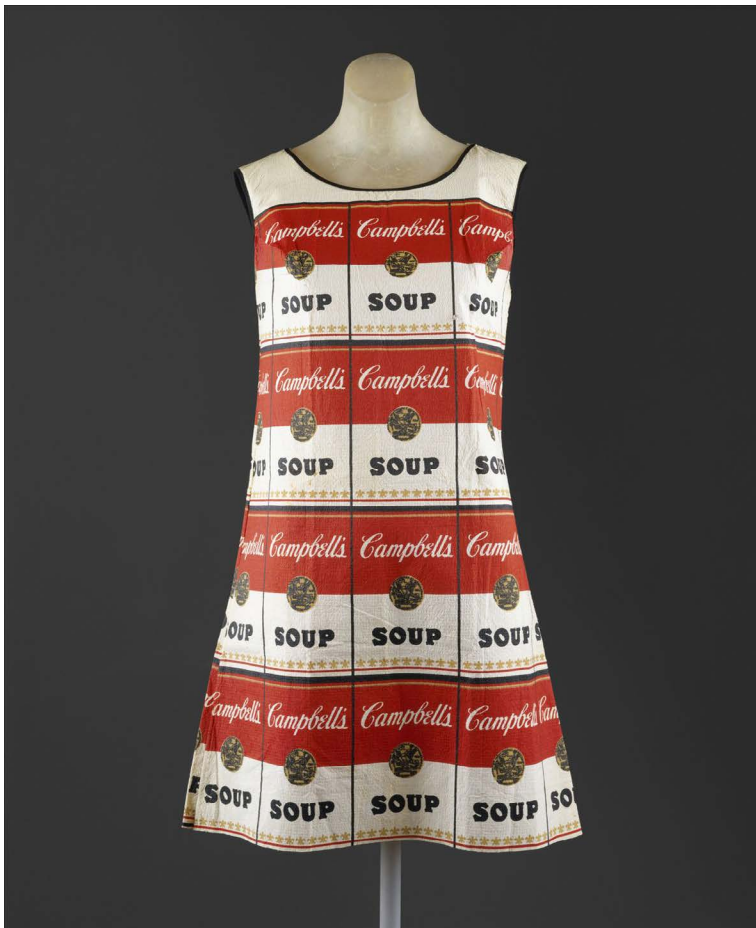
Fig. 6 1966-67 The Souper Dress, a paper dress with the repeated motif of Campbell's soup cans. Museum Collection: the Costume Institute at the Metropolitan Museum of Art.