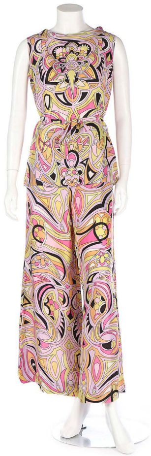
LEFT: Fig. 3 1965 Fontana Fabrics psychedelic printed silk two piece ensemble that includes wide-legged pants and a self-tie belt. Museum Collection: Kerry Taylor.