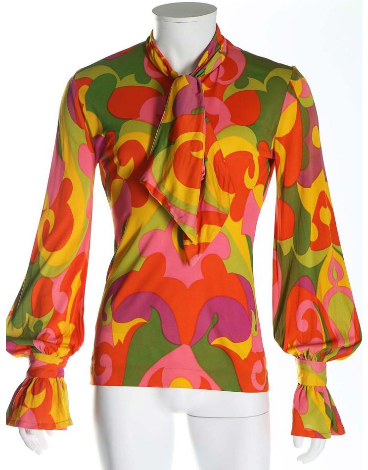
RIGHT: Fig. 4 late 1960s Beatle's Apple man's psychedelic printed nylon jersey shirt. Museum collection: Kerry Taylor.