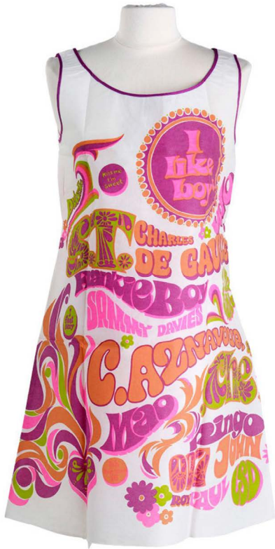
Fig. 5 1968 "I like boys" Pop art paper dress decorated with psychedelic font of famous figures such as Mao Zedong, Che Guevara, Sammy Davies Jr. and the Beatles. Museum Collection: Stiftung Haus der Geschichte der Bundesrepublik Deutschland.