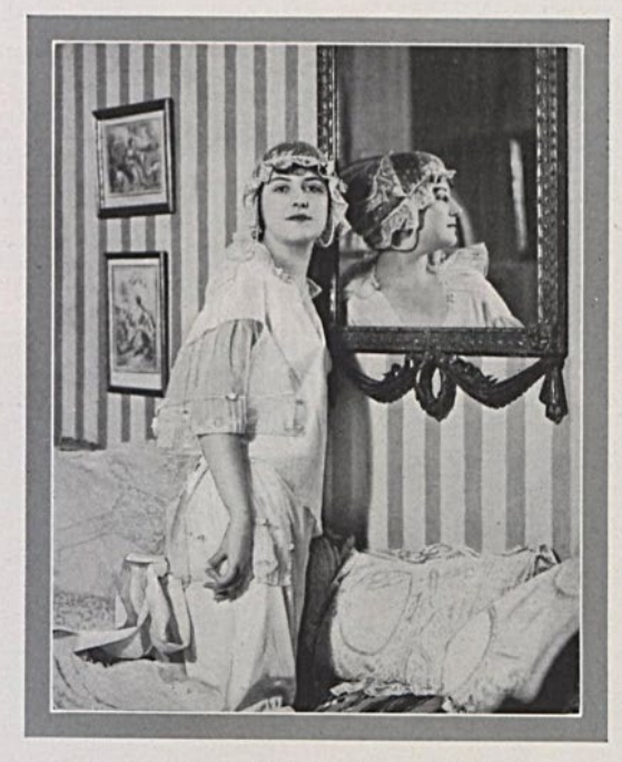
To a woman of stately, oriental type ropes of pearls dropping from the laces of her cap low over her ears are vastly becoming

Donning Femininity with Her Silken Negligée, and Firmly Concealing Wisdom under the Frills of Her Boudoir Cap, Woman Seizes the Witching Hour between Tea-time and Dinner-time to Practise the Ancient Arts of Coquetry