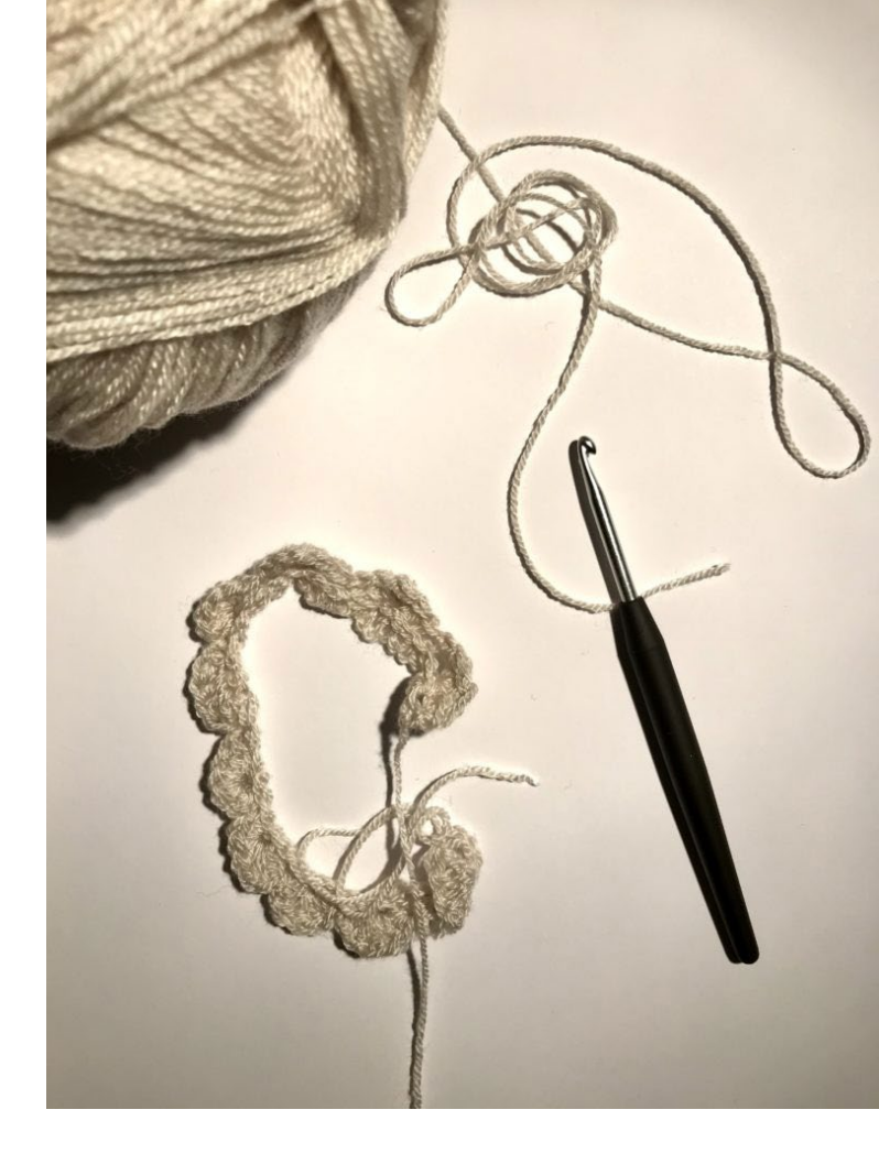
Fig. 8. Detail of crocheted netting with rosettes. Schmidt, Madi. 8 Nov. 2019, Author's own image.