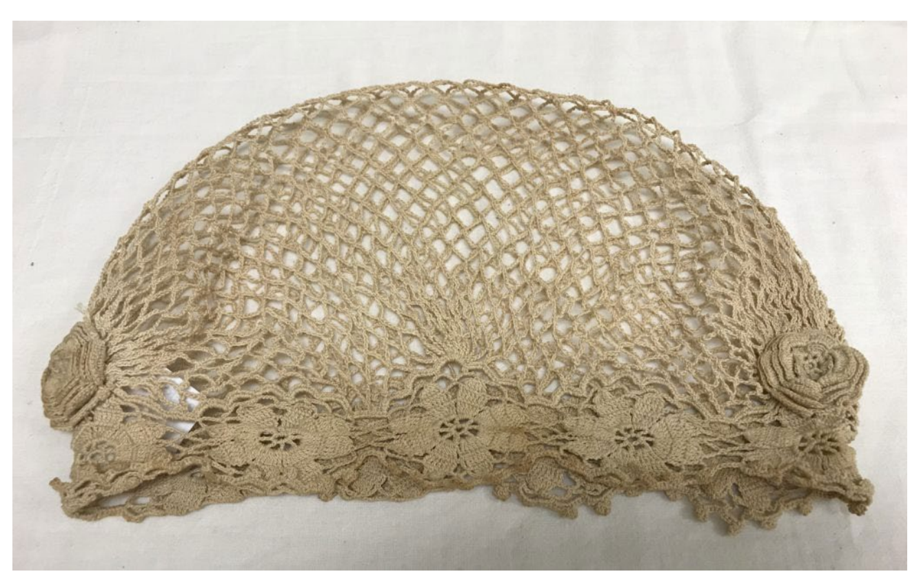
Fig. 6. Image of boudoir cap from the Toronto Metropolitan University Fashion Research Collection. 24 Sept. 2019.