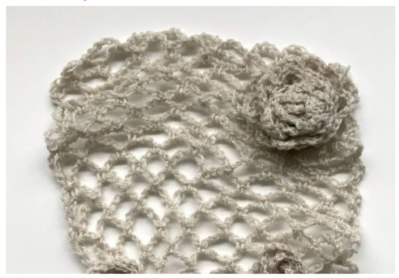
Fig. 7. Image of crocheted netting with rosettes in the style of the boudoir cap. Schmidt, Madi. 8 Nov. 2019, Author's own image.