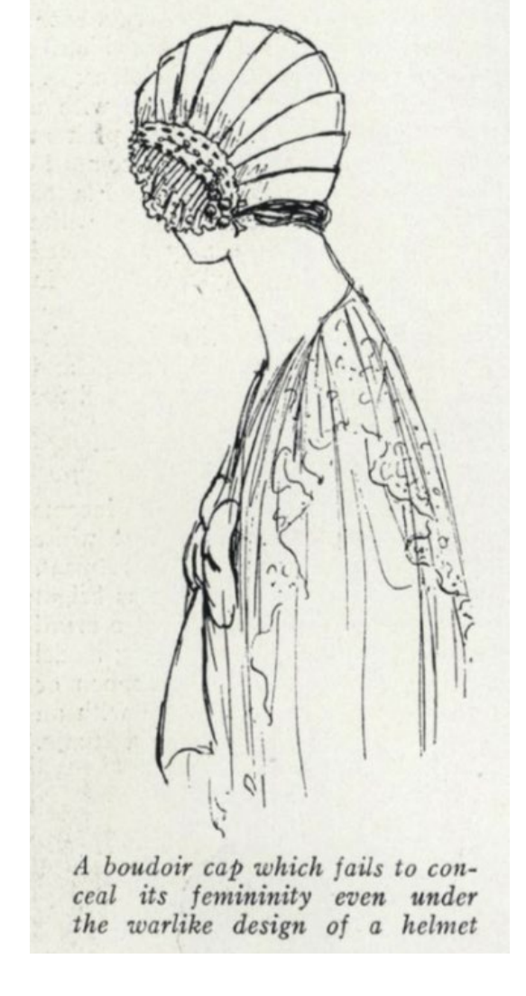
Fig. 3. Image of a Boudoir Cap modelled after a helmet, "Features: Tempting the Paris Shopper." Vogue , vol. 42, no. 2, Jul 15, 1913, pp. 46. ProQuest