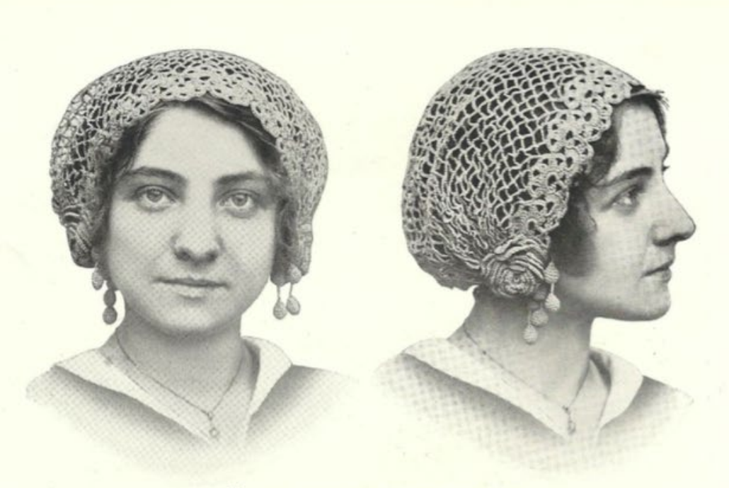
No. 38. AUTO OR BOUDOIR CAP.