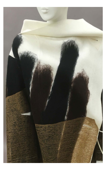
Fig. 2: Katsura, Yuki. Art It, https://www.art-it.asia/u/ TakamatsuArt/3hzblinywm ucz6ryspxf.

Fig. 3: Katsura, Yuki. Art Net, http://www.artnet. com/artists/yuki-katsura/ untitled-JDbTzsQPafKx3I PjzZYig2.