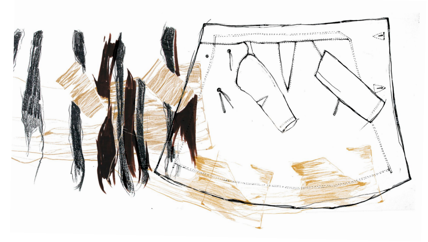
Creative Component 2. Technical Sketch inspired by Minagawa's textile process. By Tricia Crivellaro, 2019.