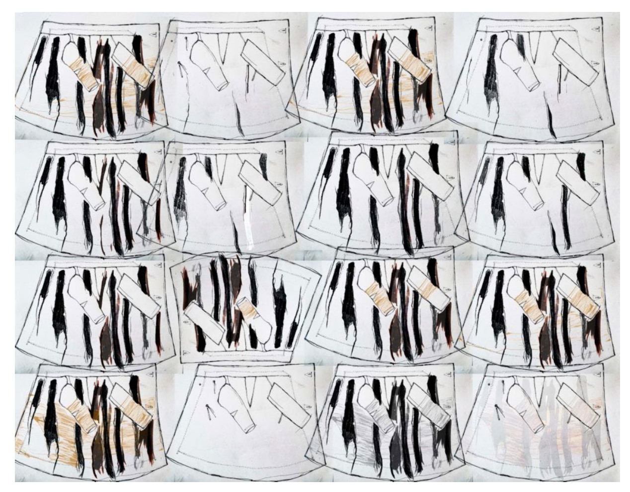
Creative Component 3. Sketches and Collage inspired by Minagawa's textile process. By Tricia Crivellaro, 2019.