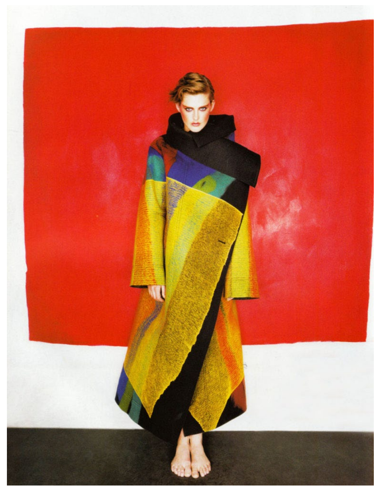
Fig. 5: 'Szucs, Agnes. "Colors from the '90s." Colors from the '90s, 27 May. 2011, <u>http://iiiinspired.</u> blogspot.com/2011/05/colorsfrom-90s.html.

For 'Prism Collage' Collection /Fall-Winter 1997/1998, Makiko Minagawa presented three different color propositions for that specific blanket coat using her intuitive method. Here is an example of a more colorful version: