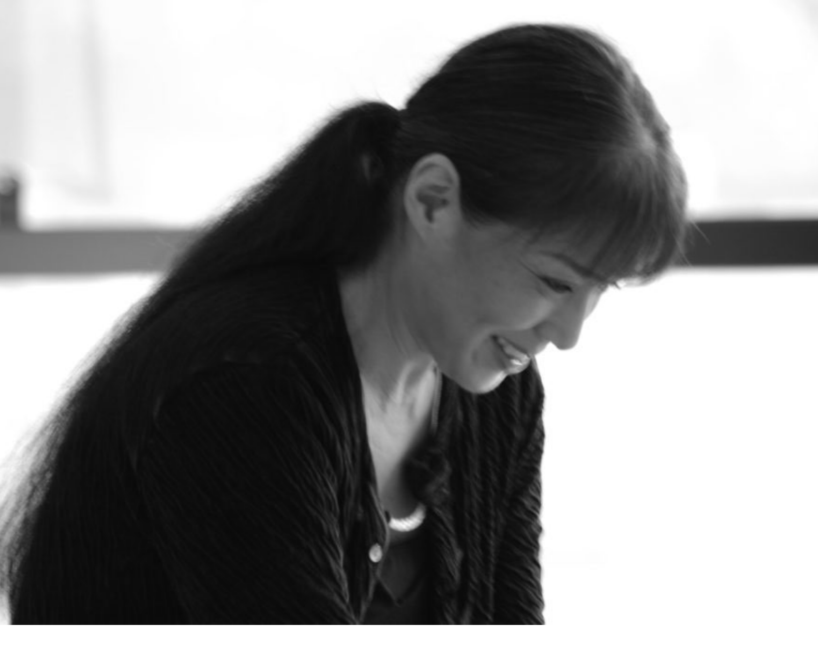
Fig. 1: "Issey Miyake's Longtime Textile Director, Makiko Minagawa, Practices Craftsmanship in Its Finest Form." Cultured Magazine , 6 Aug. 2019, https://www. culturedmag.com/ makiko-minagawa/.