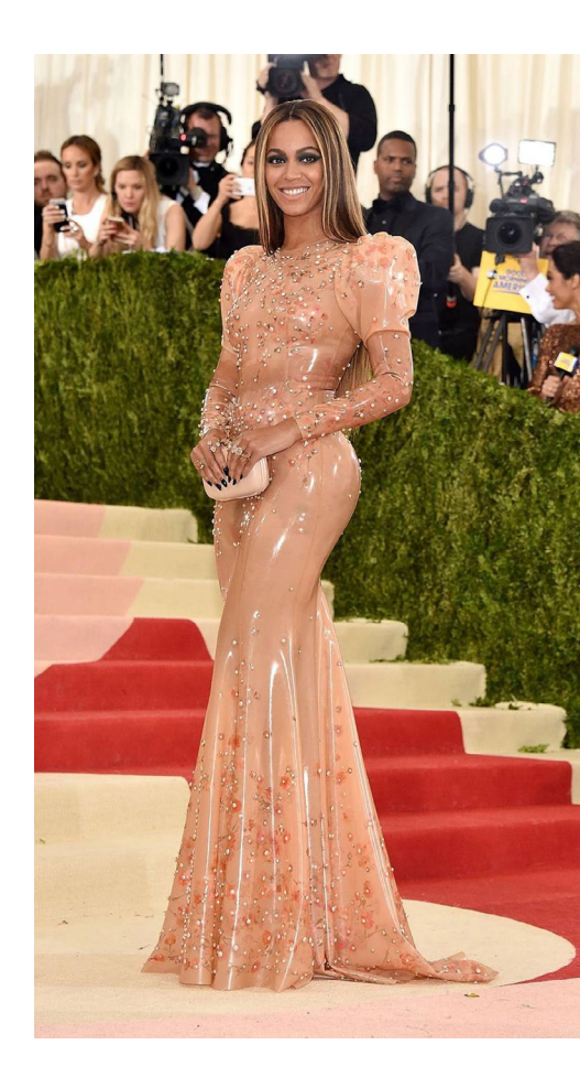
Figs, 5-7. Celebrities wearing PVC on the red carpet