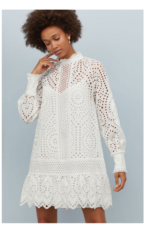
LEFT: Fig, 10. Zara dress.

RIGHT: Fig, 11. H&M dress.