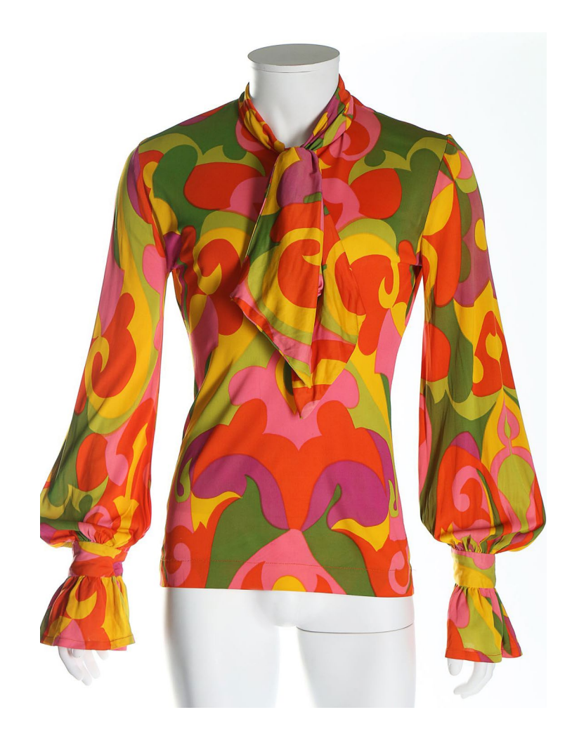
LEFT: Fig. 3 1965 Fontana Fabrics psychedelic printed silk two piece ensemble that includes wide-legged pants and a self-tie belt. Museum Collection: Kerry Taylor.