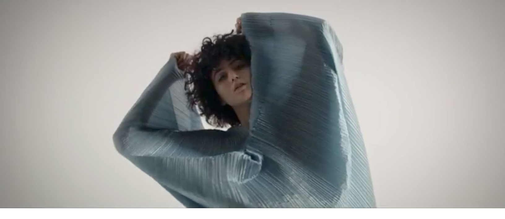
Fig. 2. Pleats Please by Issey Miyake. Youtube, uploaded by Garik Avetisov, 14 Mar. 2018, https:// www.youtube.com/ watch?v=Vmwxd4yYwjg.