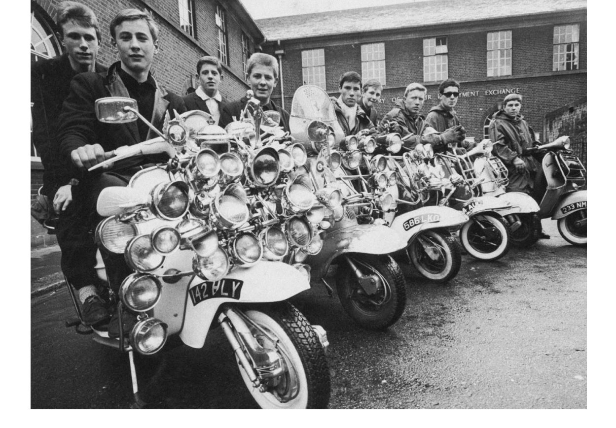
Fig. 4. A group of teenagers that portray themselves as mods. "Mods from Peckham (south London), 1964" Peacock Revolution: American Masculine Identity and Dress in the Sixties and Seventies. London: Bloomsbury Visual Arts, 2018.

The change in men's fashion challenged gender norms in North America because it blurred the lines between men's and women's dress, while women began wearing pants, men began experimenting with feminine clothing. An extreme example of men's dress venture into women's styles is the mini skirts, designed by French designer Jacques Esterel (Morin 2). Although not many men would have worn mini skirts, celebrities like Mick Jagger were seen preforming in a skirt which set an example for men across the country to expand in other ways into more feminine wear (Hill 95). It became common for men and women to shop for each others' clothes and eventually companies began manufacturing certain clothing to not be gender specific (Hill 125). The best example of this was the trench coat that in the 1960 was designed the same for both men and women (Hill 125).