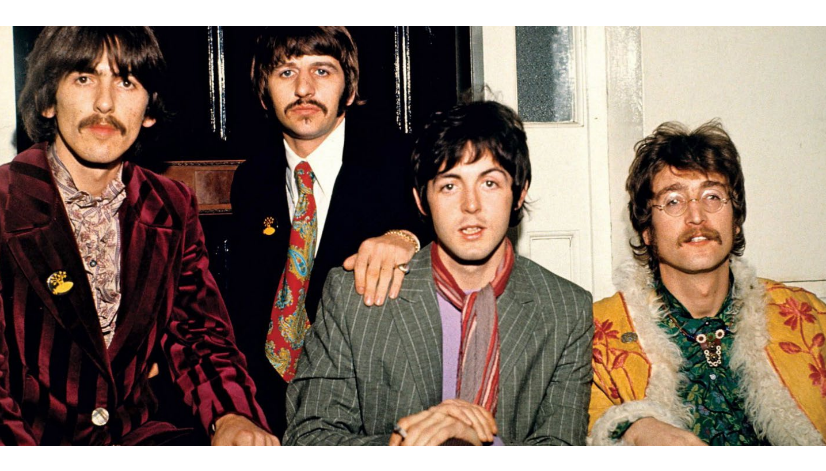
Fig. 3. The Beatles dressed in bright colors, representative of the peacock revolution. "The Beatles at Abbey Road Studios." Newsweek, 14 May 2017, https://www.newsweek.com/2017/05/26/beatles-sgt-pepperslonely-hearts-club-band-paul-mccartney-johnlennon-george-608717.html.

Other influential men were the British pop stars that became popular in America in the 60s, most notably the Beatles, who brought with them new ways of dressing (Hill 93) The Beatles often wore heeled shoes, tailored suits, skinny ties, although suits were seen primarily as men's wear, during this time it became more common to see women in pants and pant suits (Morin 3). The Beatles also often wore gender-less and feminine style accessories such as scarves and neckless, which inspired and influenced men in North America.