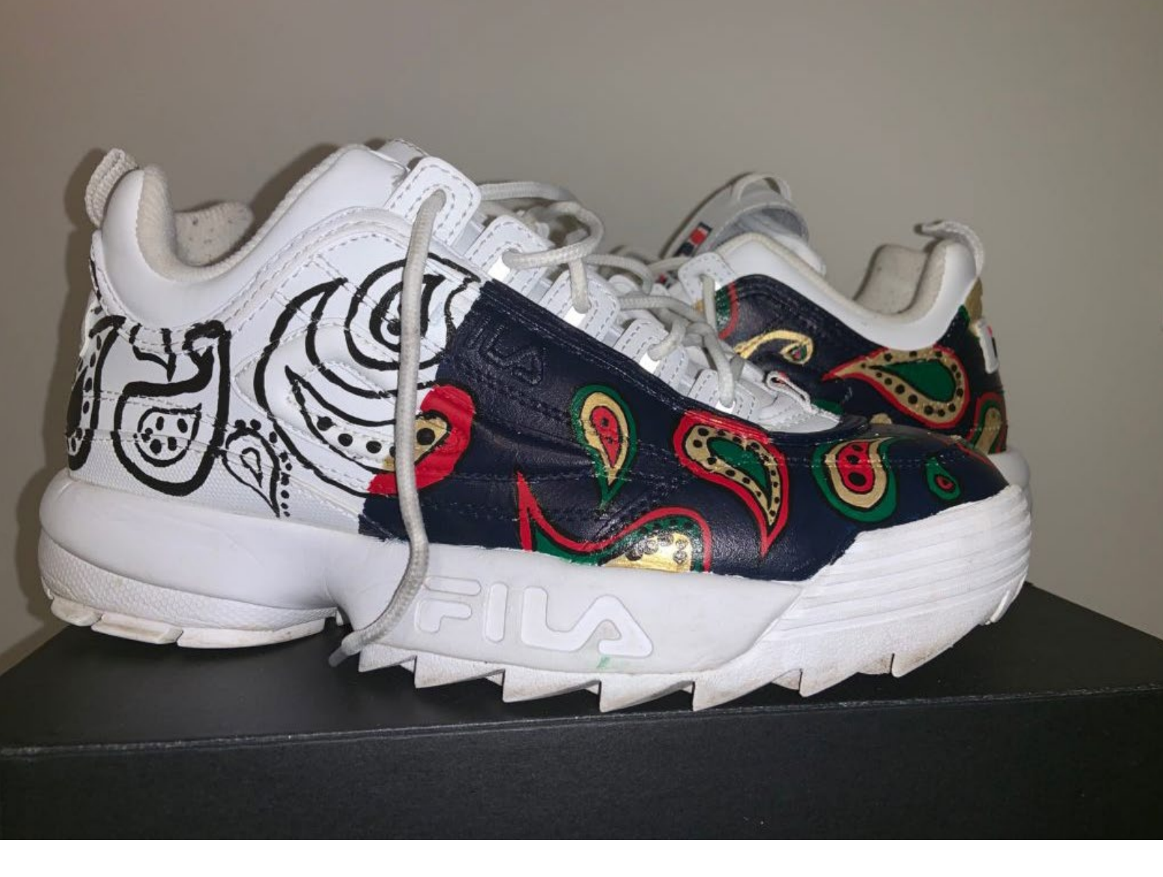
Fig 5. Paisley painted sneakers inspired by the jacket in Toronto Metropolitan University's fashion collection. Morris, Kaleigh. "Paisley Sneaker", 11 Nov. 2019.