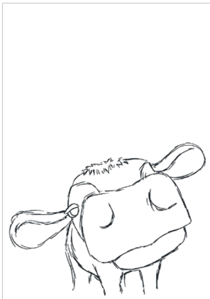
Figure 2: Integer nisi sapien, porta at.

Maecenas condimentum egestas ligula eu tempor. Nullam metus mauris, elementum et consetetur sit amet, tincidunt quis ligula. Duis purus mauris, varius ac erat quis, ullamcorper eleifend leo. Donec vel pretium leo. In consequat turpis ligula, nec congue neque cursus non. Nunc et nibh non mauris finibus ornare in vitae sem. Donec bibendum facilisis tempor. Morbi at interdum neque. Nullam non nisl consequat, cursus mi at, mattis urna. Nam ultricies neque tellus, non posuere felis maximus eget. Suspendisse venenatis lobortis gravida. Aenean accumsan metus vitae dictum laoreet.