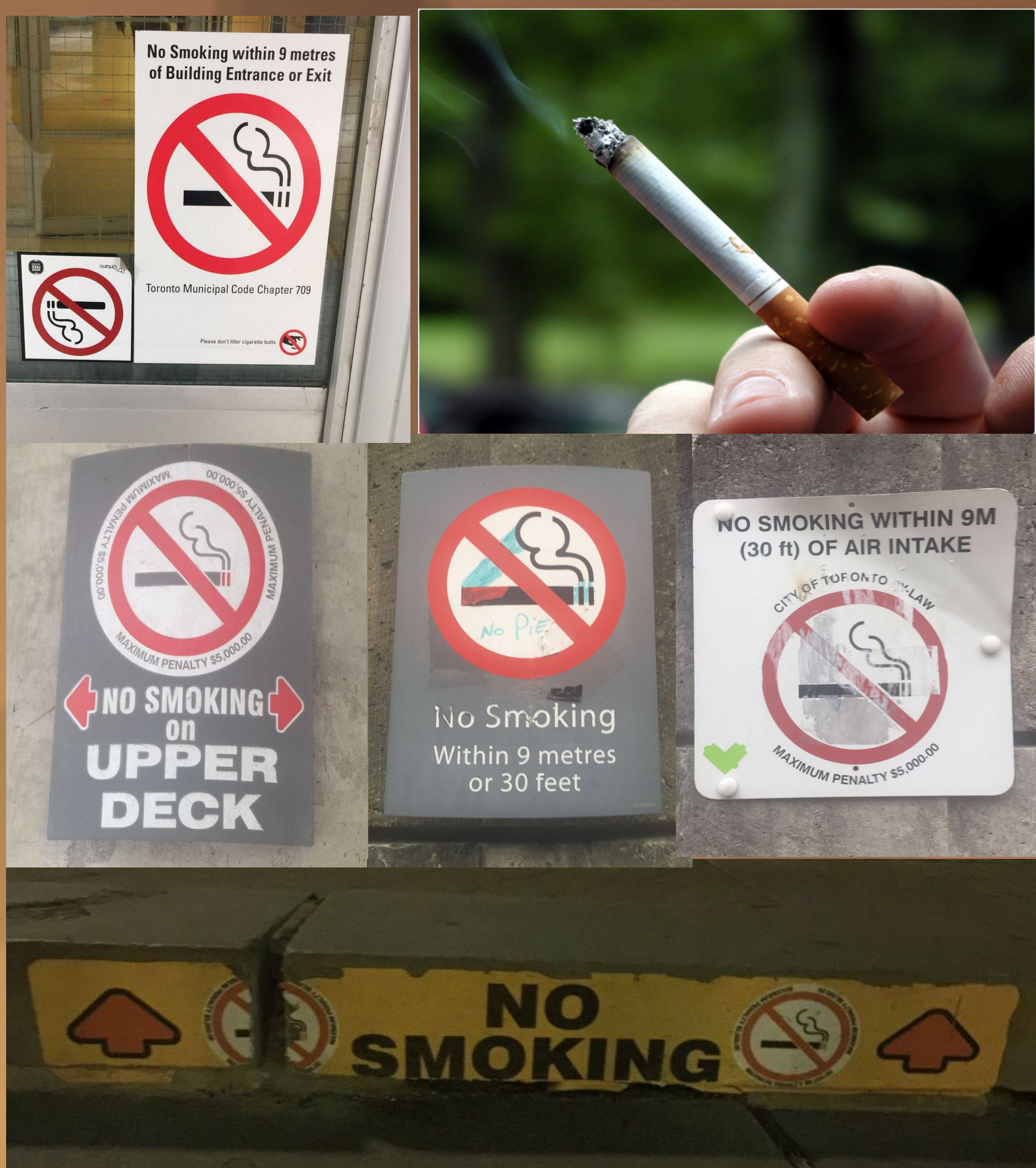
Examples of smoking prohibition signage on campus (photos taken by HZ). Cigarette stock image taken from http://www.freeimages.com