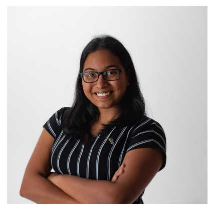
Project Control Officer - CGI