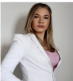
Property Administrator, Allied Properties REIT (March-October 2021)