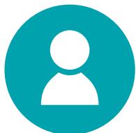
Income Tax Auditor