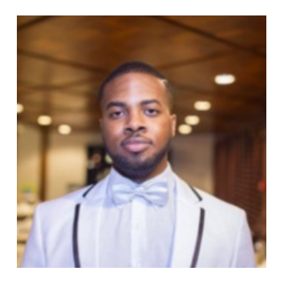
Green Career Centre Youth Green Careers Specialist