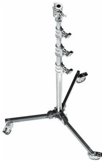
Grip Stand - Rolling Base