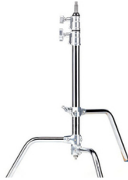
Grip/C Stand Short