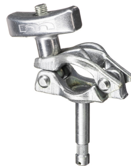
Clamps - Eye Coupler Grid