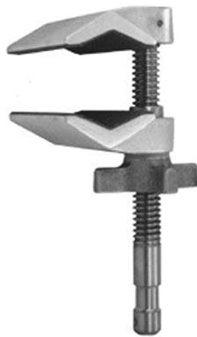
Clamps - Cardellini