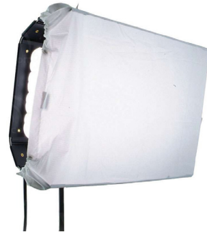
Kino 401 Diffusion Cloth