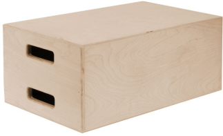
Apple Box - Full