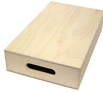
Apple Box - Half