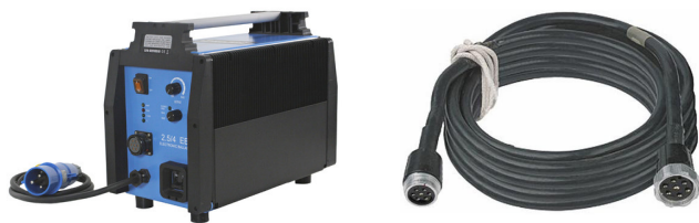
HMI Ballast and Head Cable