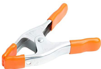
Clamps - Pony