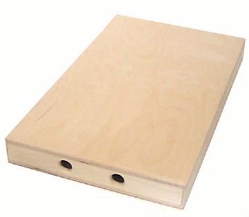
Apple Box - Quarter