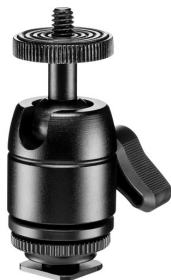
Chroma Shoe Mount