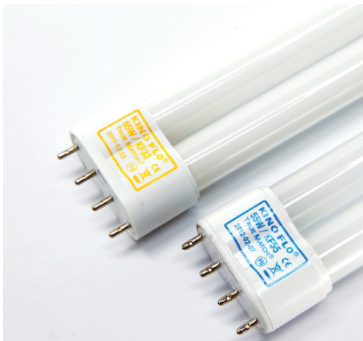
Kino Light Bulb